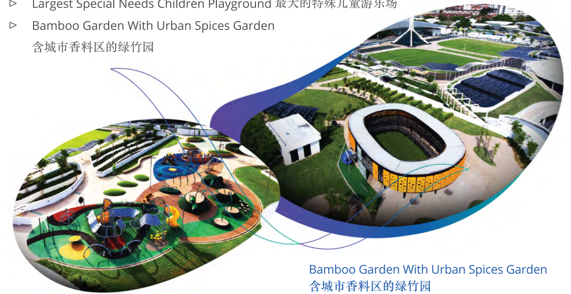
Bamboo Garden With Urban Spices Garden 含城市香料区的绿竹园