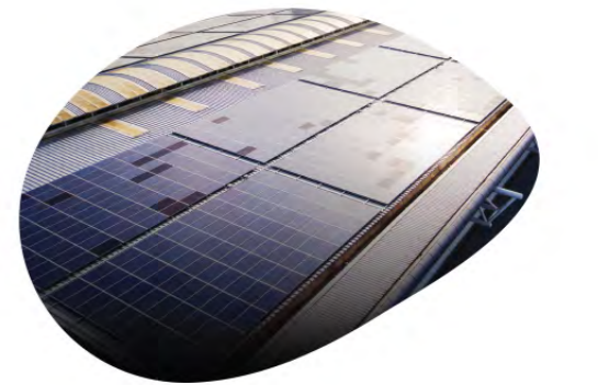
The Largest Hybrid Solar PV Farm in Penang 檳城最大混合太阳能PV光伏电站