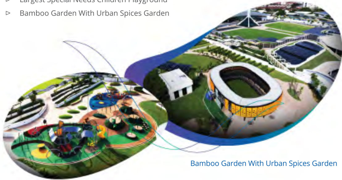
Bamboo Garden With Urban Spices Garden