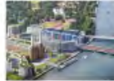
Retail & Commercial